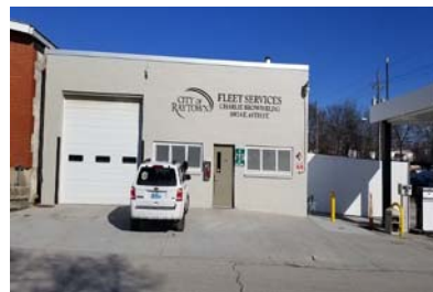
Underground Fuel Tank Finished