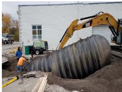
Fuel Tank Construction