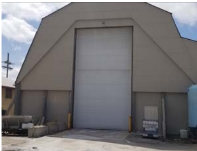
Salt Barn Overhead Door