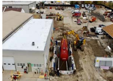
Fuel Tank Construction