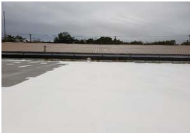
New Fleet Services Roof