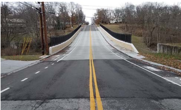
83rd Street Bridge Completed