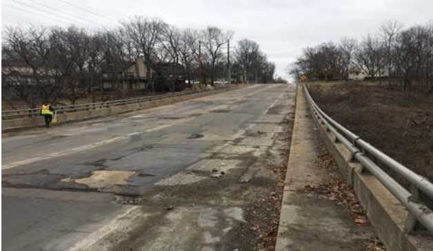
83rd Street Bridge Before Construction