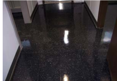
Fleet Services Interior Remodeled