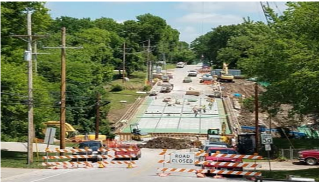
83rd Street Bridge Under Construction